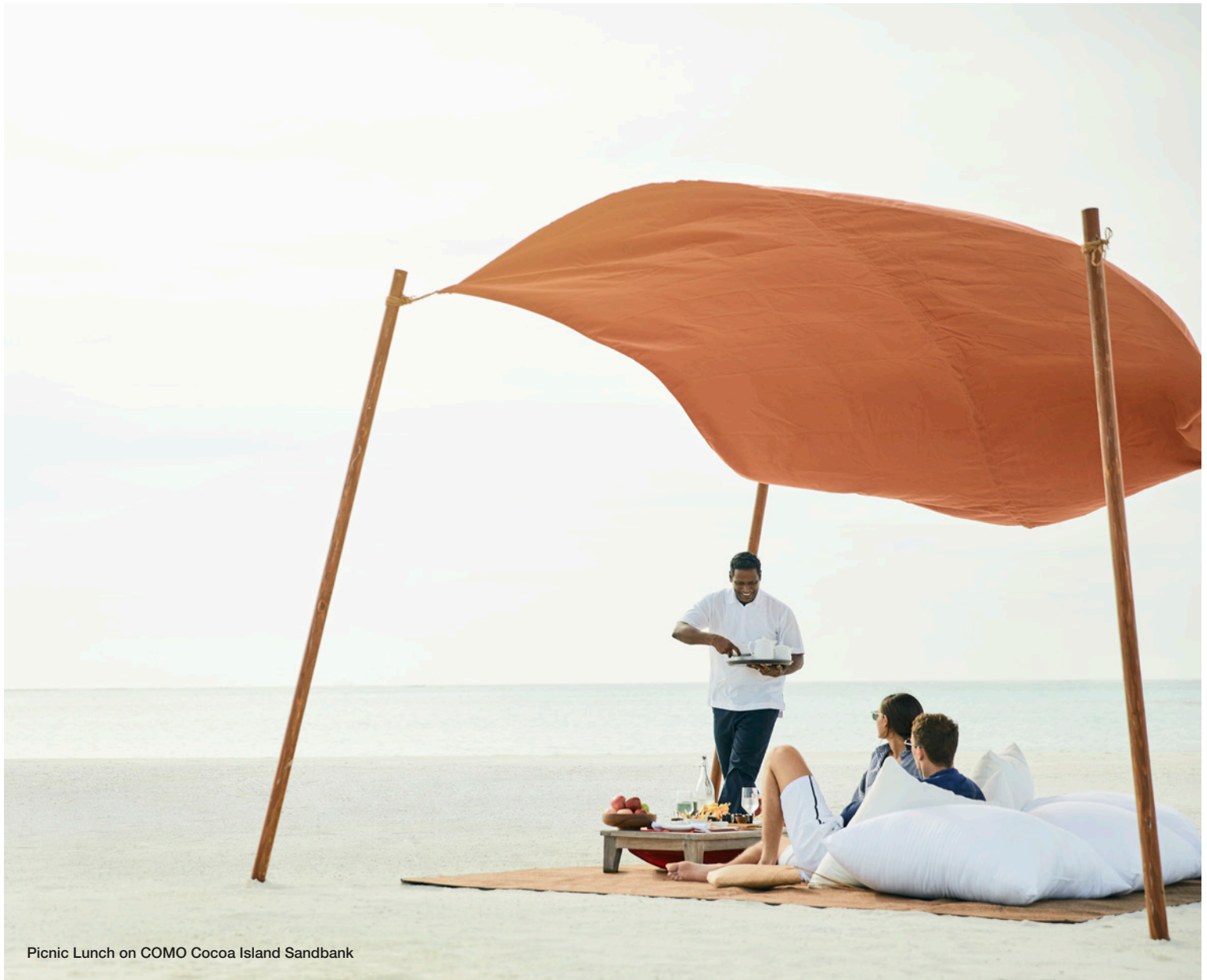
Picnic Lunch on COMO Cocoa Island Sandbank