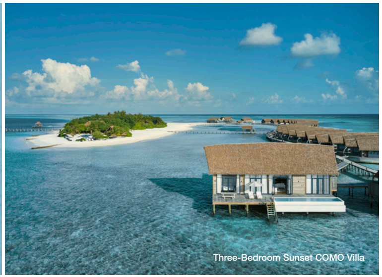
Three-Bedroom Sunset COMO Villa