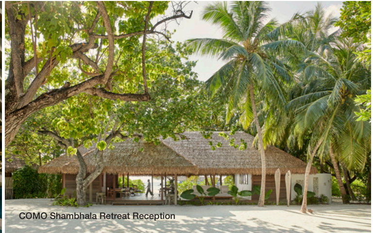
COMO Shambhala Retreat Reception