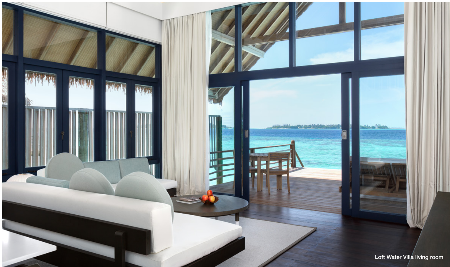
Loft Water Villa living room