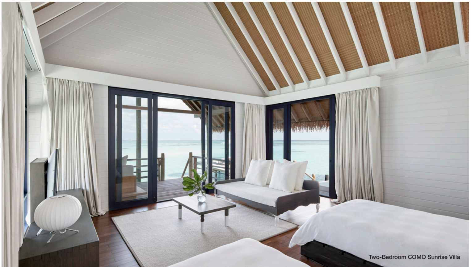
Two-Bedroom COMO Sunrise Villa