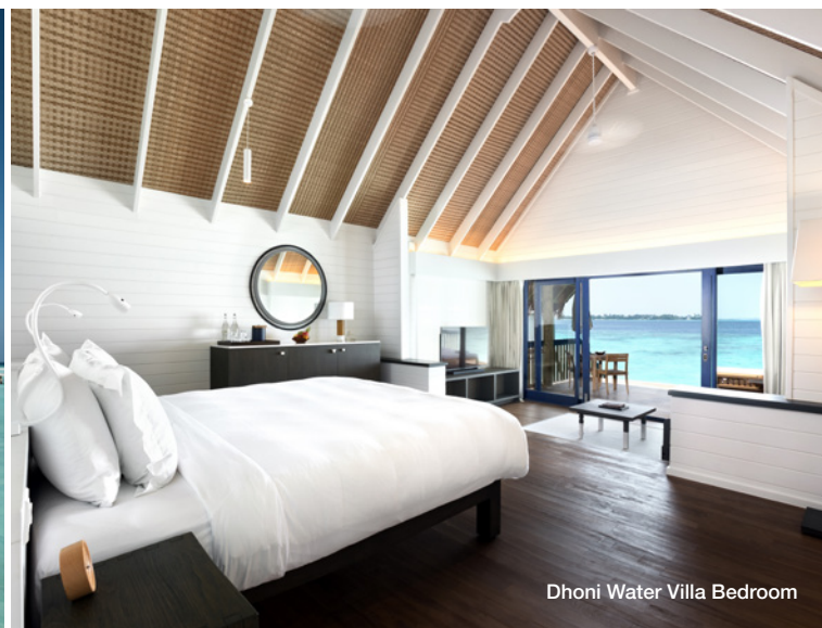
Dhoni Water Villa Bedroom