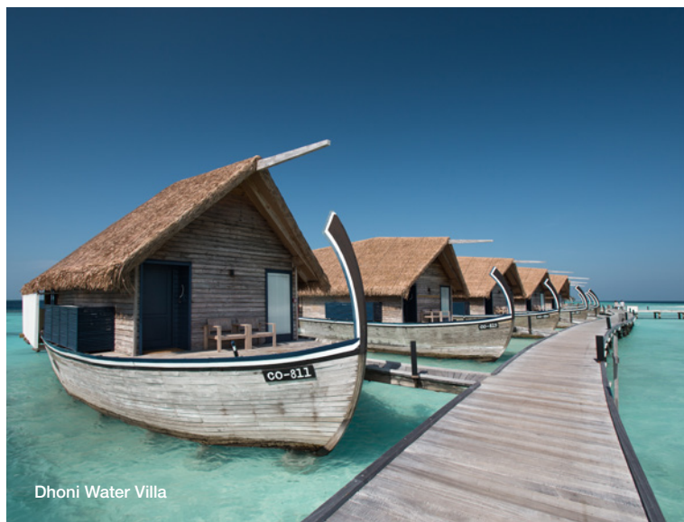
Dhoni Water Villa