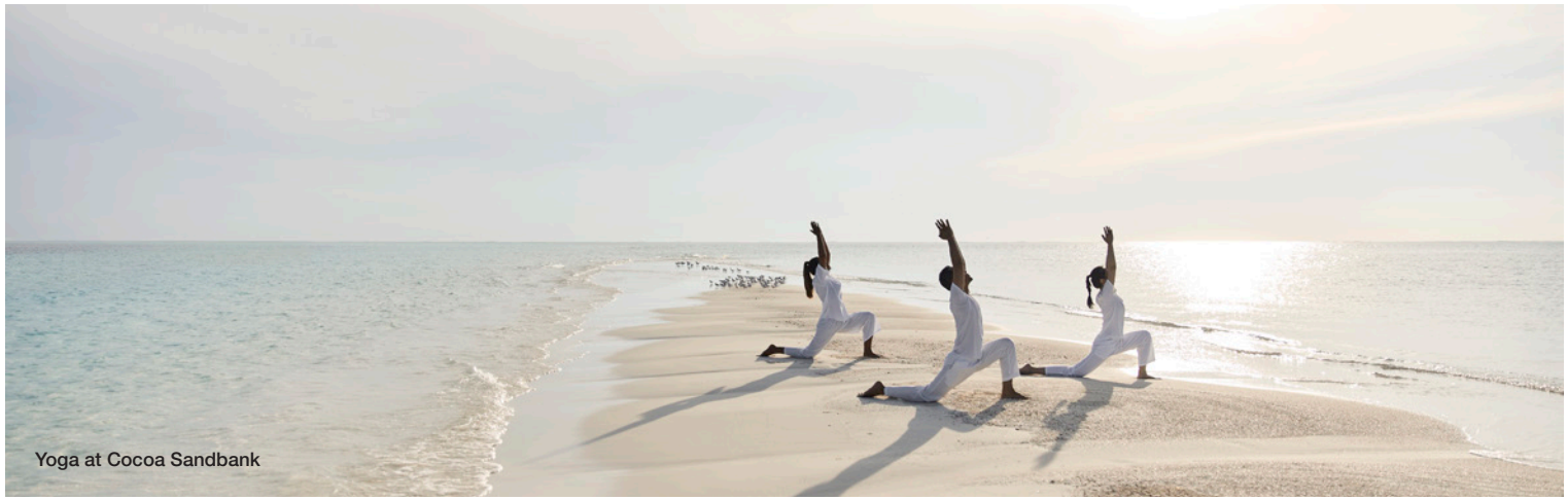
Yoga at Cocoa Sandbank